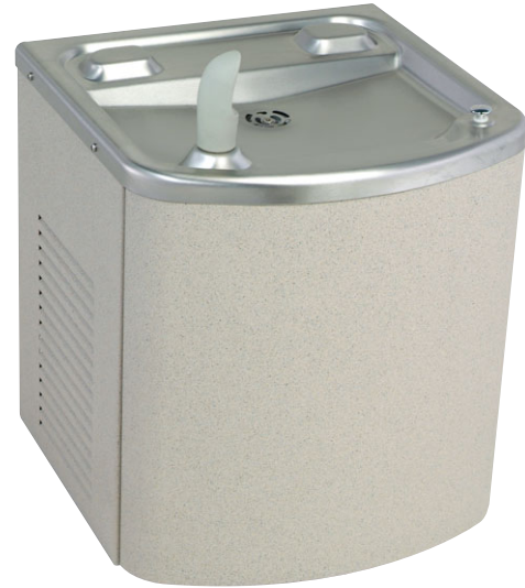
Model A311108F Shown