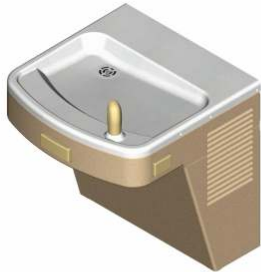
Model A111108F Shown