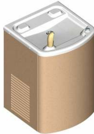
Model A311105F Shown